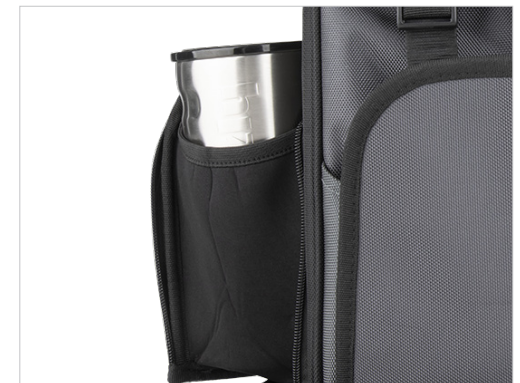
Side Drink Holder