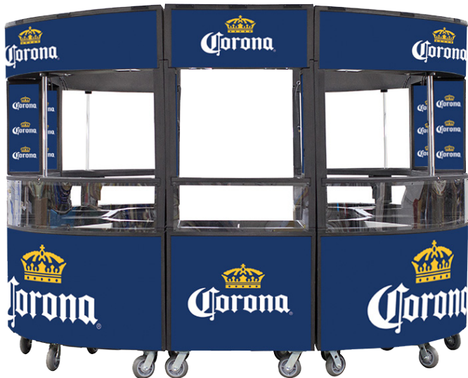
7 PIECE UNIVERSAL