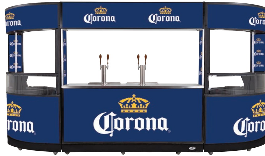
3 PIECE UNIVERSAL DRAFT

Both large and small support carts provide extra storage and surface area. Locking lids keep your merchandise safe and secure. If you can dream it, we can create it. Customize your Universal today!