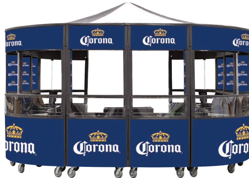
10 PIECE UNIVERSAL