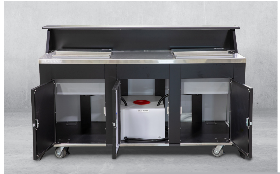
ICE BINS & RESERVOIR